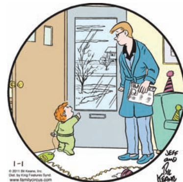
"I thought it was gonna be a New Year? This looks just like the OLD year."